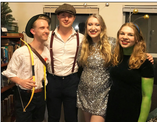
Scholars dressed in costume for Halloween.

A real highlight last semester was visiting Boston and New England during fall break. Despite accidentally hiring a massive pick-up truck (see photo) and attempting to take it through the city center, it was the most amazing trip, and was especially lovely to connect with some Bobbies while we were there! (And what could be more American than a road trip in a pick-up?) I also visited Washington D.C, Nashville and Phoenix this fall, all of which have been really special experiences. I've met lots of Bobbies so far, and can't wait to keep meeting more!