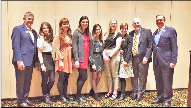
Gathering at the Atlanta Athletic Club in January.