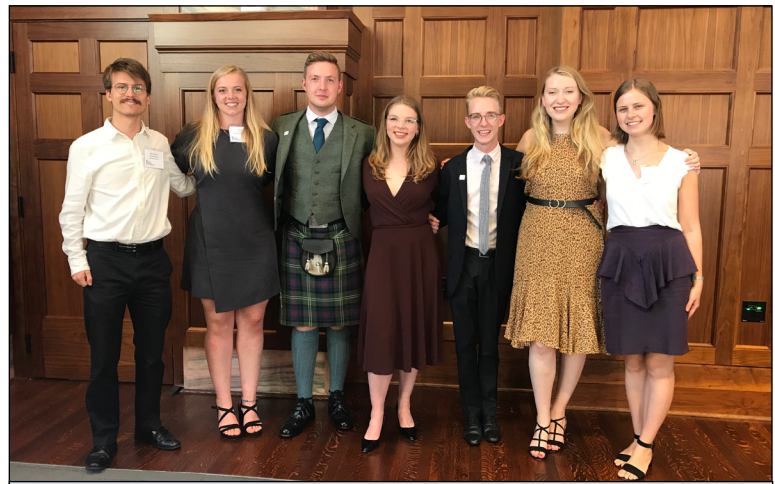
Scholars and Fellows at Fall Reception on September 22, in Convocation Hall.