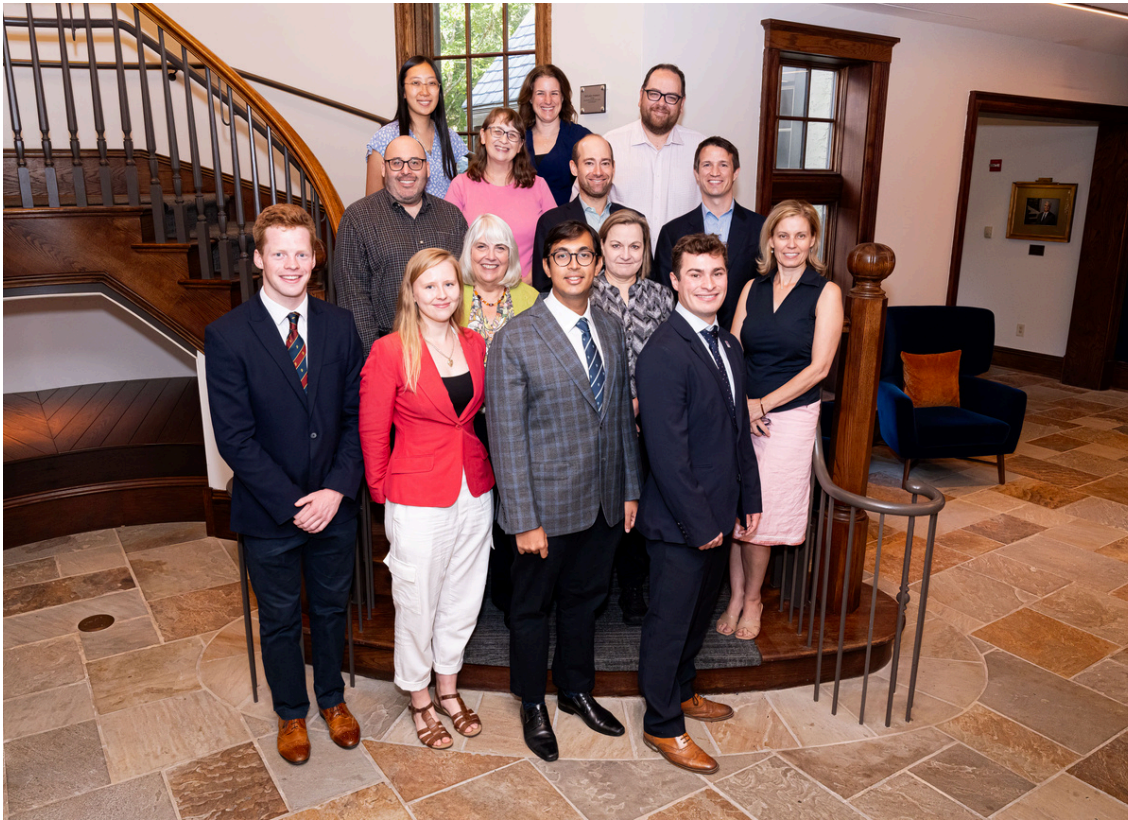
Bobby Jones Program Alumni