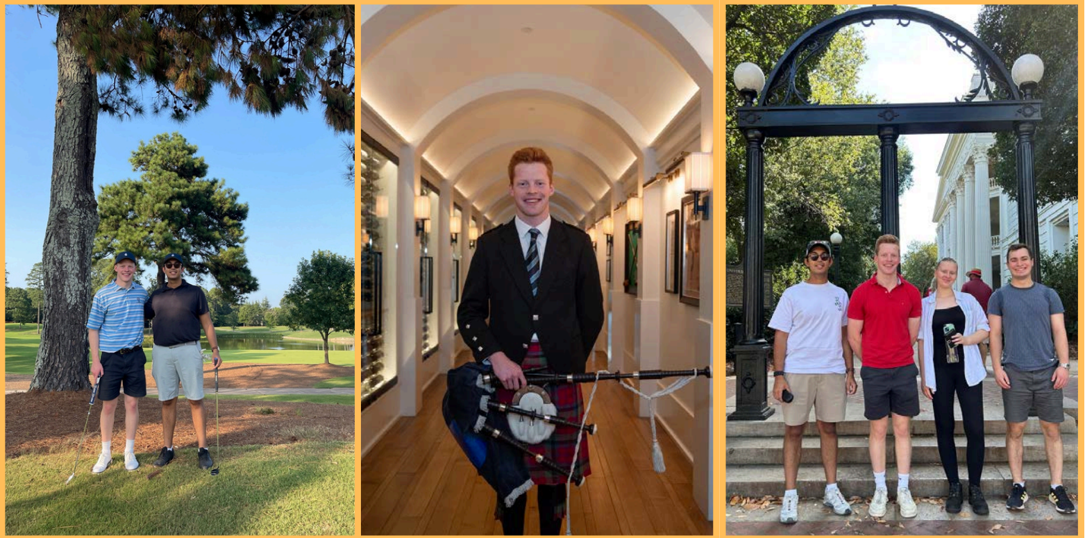
Left to Right: Atlanta Athletic Club's biggest fans; piping at Atlanta Athletic Club's 125th Gala Dinner; and 24BJS posing in front of UGA's iconic Arch on North Campus