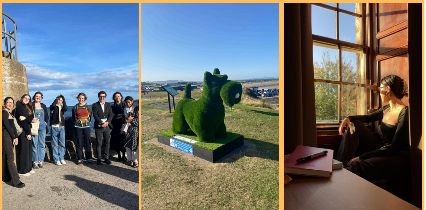
Left to Right: Alicia's anthropology, art, and perception cohort; her favorite Scottie dog statue in town; and gazing at the view from the window seat in her room

I took a day trip to Edinburgh during one of my first weekends here and immediately fell in love with it as well. I definitely want to go back as soon as I can, as one day is certainly not enough to explore everything! I also want to travel to other areas in Scotland, such as the Highlands, while also taking advantage of the cheap flights to neighboring countries! Unfortunately, I could not evade the dreaded freshers' flu that's been circulating Deans Court, so I haven't been able to put these plans into action quite yet, but I'm hoping for a quick recovery so I can continue to explore new places and try new things! All in all, I'm so excited to see what the rest of the year has to offer!