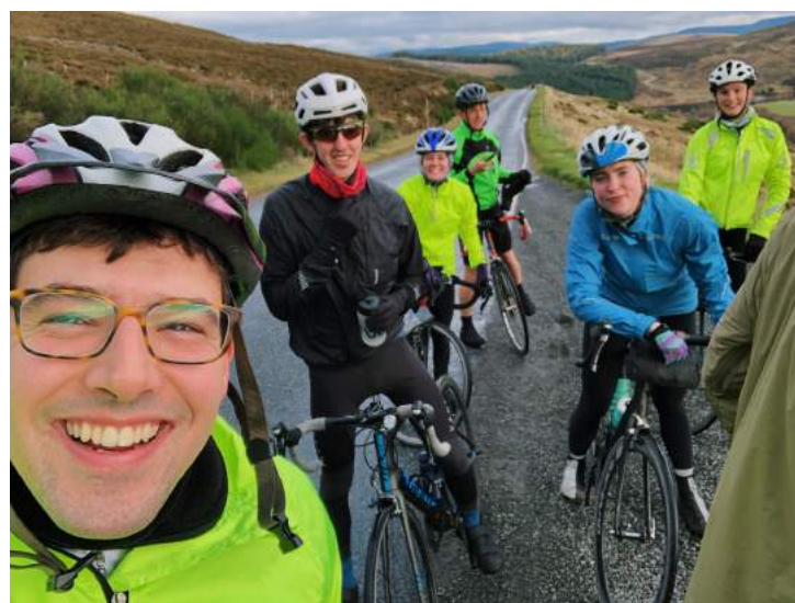
70 miles into the ride, final stretch of our century through the Highlands in Cairngorms National Park