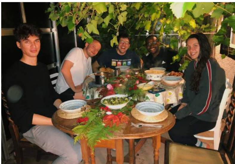
Dinner with Deans Court friends in Drumadrochit (near Loch Ness) under the grapevines at our AirBnB

I'm very thankful for the Bobby Jones community and their support this year. Be it a WhatsApp from an alum or comments in response to a post in the Facebook group, the community across the pond has been welcoming to us during our time here. I'm also planning a trip to the range to *attempt* golf in the near future and hope to visit the R&A to learn more about the legacy of Bobby Jones. Though I won't be returning home for the holidays, I'm looking forward to traveling to London, Israel, Switzerland, Spain, Jordan, and other places in Europe with friends and family for winter break. Happy holidays to all!