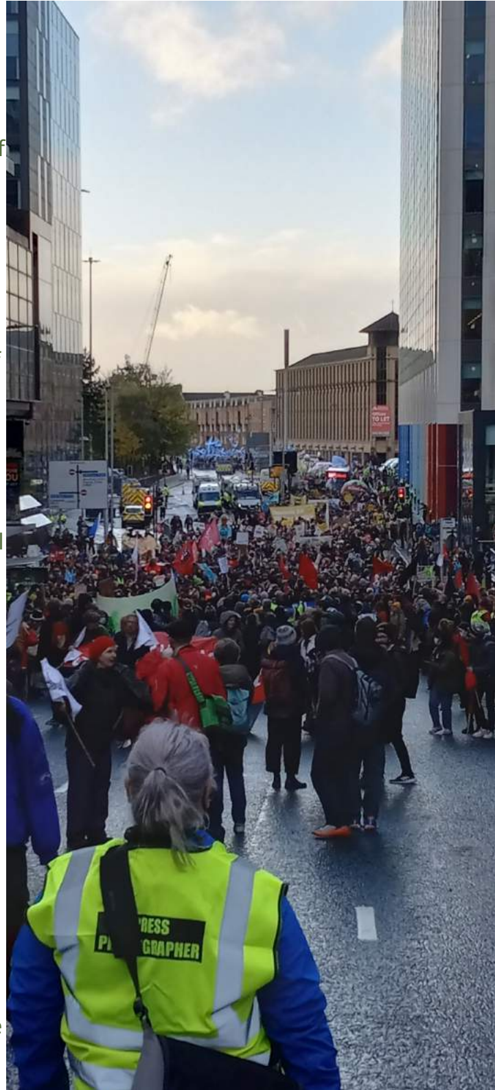
COP 26 climate march in Glasgow

When I first began writing Flounder, my play about climate catastrophe, I sought to figure out how people create pockets of joy in difficult, devastating circumstances. After working on this piece and attending the COP 26 Climate marches in Glasgow I have come to realize that when we give ourselves permission to try on new experiences and contemplate new possibilities -- whether that be directing a play, demanding a right to a livable Earth-- we get closer to living an embodied and whole life. That is a powerful concept that I am grateful to have grasped at 23-years-old, here in a cold and salty Scottish seaside town.